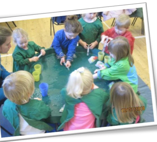
The children split in to 'teams' at key times with their keyperson – it's amazing how quickly they can tidy up when it's a race! We also use our teams for more focused small group work

Teddy – our Playgroup Ted will be sent home with you if your child has done something we are particularly proud of. Please share a photo of what Ted has been up to whilst with you via your Tapestry account. We will ensure all children have a turn with Teddy, and they feel proud to have earned him.